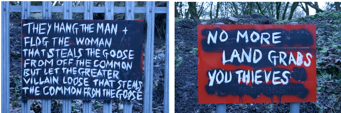
Amended “Warning – Keep Out...” signs