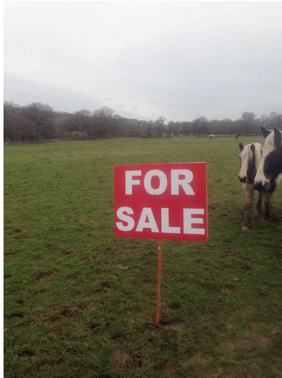
A3: A Plot