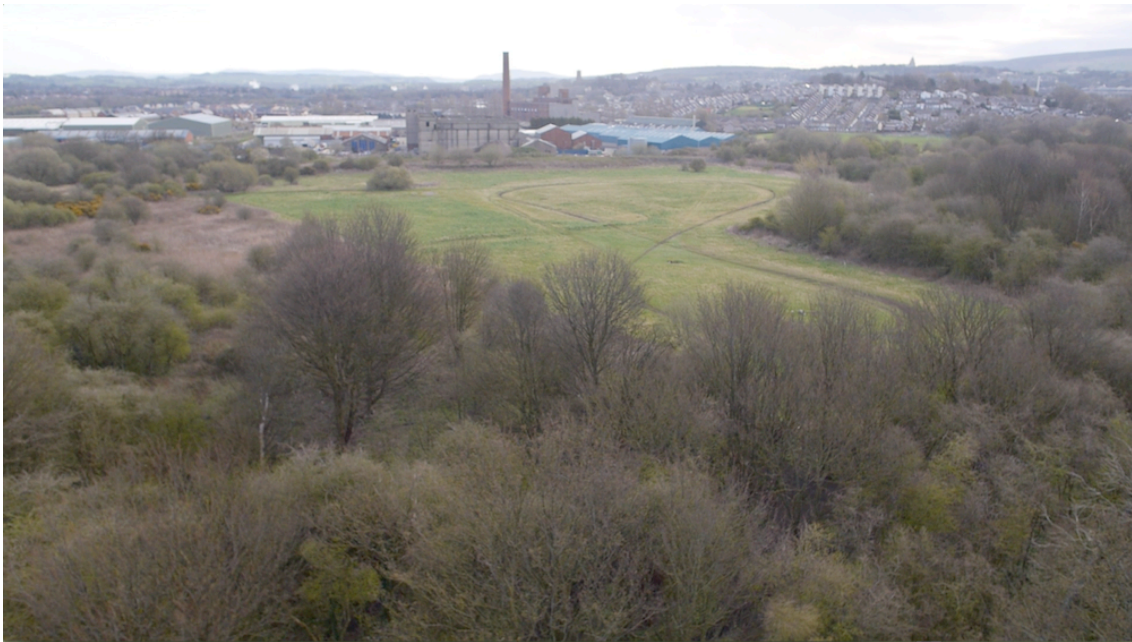
Freeman's Wood : Aerial view